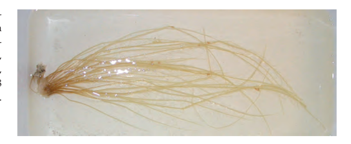
Fig. 13. Plumularia adjecta Fraser, 1948, paralectotype from Velero III station 1096-40, Mexico, Oaxaca, Gulf of California, Puerto Escondido, 25°48′10″N, 111°17′55″W, 18-21 fm (33-38 m), sand + cake urchins, 11. ii.1940.

whether conspecific with lectotype), SBMNH 347485 (labeled as voucher).