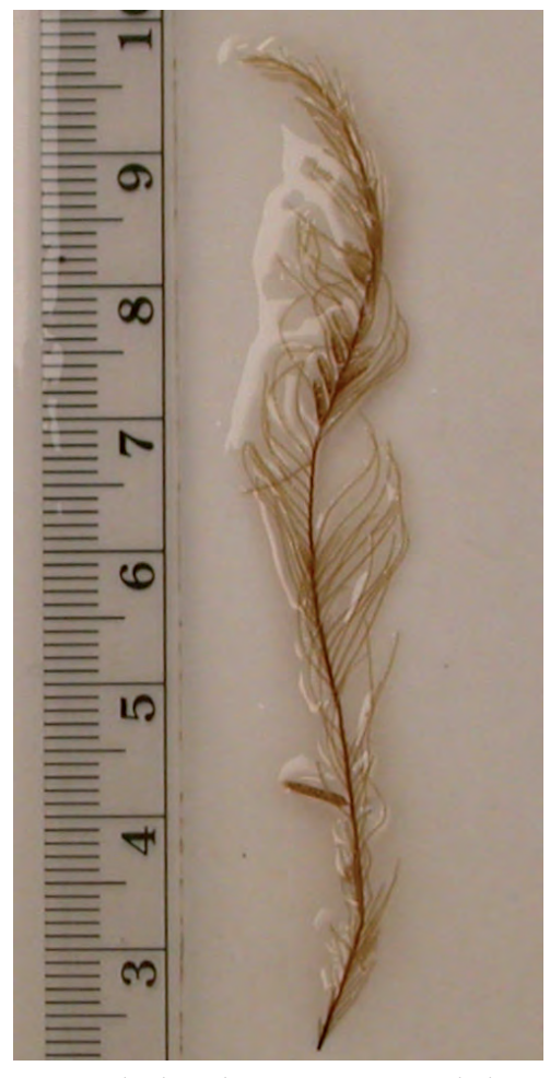
Fig. 8. Aglaophenia longicarpa Fraser, 1938b, lectotype from Velero III station 607-36, Mexico, Baja California Sur, Gulf of California, San Lorenzo Channel, 24°21′35″N, 110°20′10″W, 24 fm (44 m), coralline, 21.iii.1936.

Paralectotypes.— Velero III station 607-36, as above for lectotype, many plumes, largely detached, some with short basal stolon, unbranched stems, up