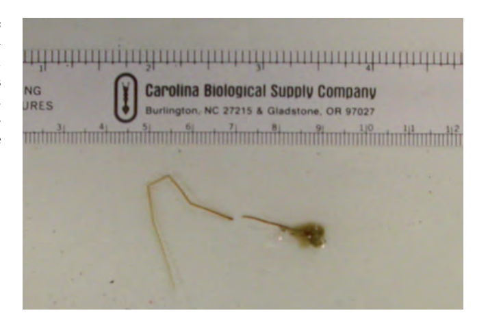
Fig. 10. Antennularia mutabilis Fraser, 1948, lectotype from Velero III station 1254-41, Mexico, Baja California Norte, 8 miles southwest of Cedros Island, 28°00″17″N, 115°28′43″W, 63-65 fm (115-119 m), green, fine sand + coral, 26.ii.1941.

Remarks.— The lectotype is composed of a basal stem portion, ca. 20 mm long and rooting in a sponge, and a distal part, 55 mm long, with well preserved hydrocladia but without gonothecae. Both were found in the same vial and seem to belong together,