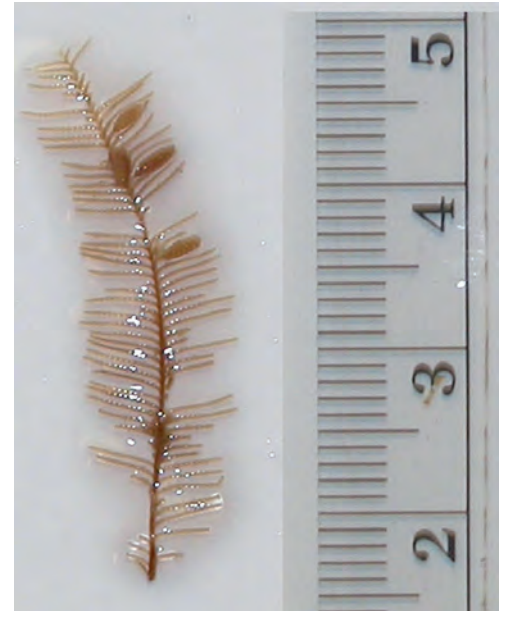
Fig. 7. Aglaophenia lateseptata Fraser, 1948, lectotype from Velero III station 1121-40, USA, California, Ventura County, off San Nicolas Island, 33°20′20″N, 119°29′50″W, 40-48 fm (73-88 m), broken shell + boulder, 11.iv.1940.

Velero III station 1294-41, USA, California, Santa Barbara County, Santa Cruz Island, ½ mile south of Gull Island, 33°56′30″N, 119°49′40″W, 34-41 fm (62-75 m), sand + shell, 11.iv.1941, two muti-