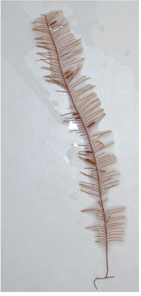
Fig. 4. Aglaophenia epizoica Fraser, 1948, lectotype from Velero III station 1296-41, USA, California, Santa Barbara County, Santa Cruz Island, 1 mile east of Smuggler's Cove, 34°01′10″N, 119°31′20″W, 19-20 fm (35-37 m), rock + kelp, 12.iv.1941.

Velero III station 1190-40, USA, California, Santa Barbara County, Anacapa Passage, 33°58′45′N, 119°32′15″W, 15-50