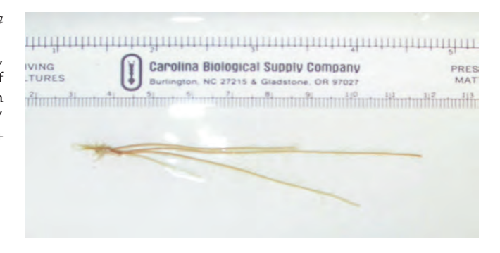
Fig. 12. Antennularia septata Fraser, 1938, lectotype from Velero III station 562-36, Mexico, Baja California Norte, Gulf of California, east of San Esteban Island, 28°41′25″N, 112°32′15″ W, 20-70 fm (37-128 m), sand + rock, 10.iii.1936.

Lectotype.— Velero III station 562-36, Mexico, Baja California Norte, Gulf of California, east of San Esteban Island, 28°41′25″N, 112°32′15″W, 20-70 fm (37-128 m), sand + rock, 10.iii.1936, four stems attached to communal basal part rooted in sponge, 80, 60, 45 and 20 mm high (in all top part missing), no gonothecae, SBMNH 347473 (labeled as voucher) (AHF Holotype No. 127) (fig. 12).