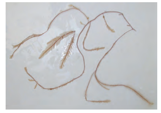
Fig. 5. Aglaophenia fluxa Fraser, 1948, lectotype from Velero III station 1241-41, USA, California, San Diego County, 7½ miles south of Point Loma, 32°33′10″N, 117°15′16″W, 30-33 fm (55-60 m), coarse sand, 23. ii.1941.

Velero III station 1127-40, USA, California, Los Angeles County, off Huntington Beach, 33°38′30″N, 118°00′20″W, 4-20 fm (7-37 m), no substrate data, beam