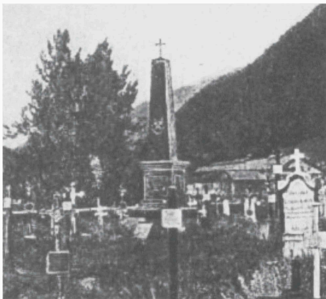
Fig. 2. Tombstone to the 17 Idrija miners died in pit fire in 1846.

Once again, the unfavourable environmental conditions caused by the pit fire led to the deterioration of the general state of health in Idrija. They also affected fertility, which in 1847 decreased substantially in comparison with the period preceding the fire. No data are available on increased mortality in this period.