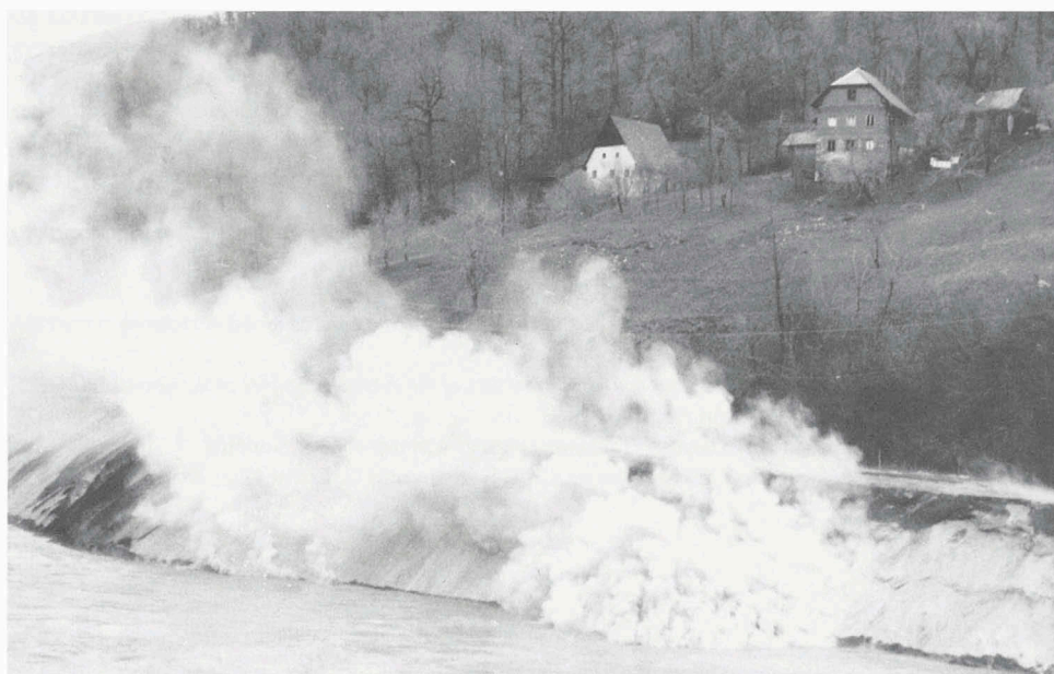
Fig. 6. During high waters, the Idrijca River carried away the burnt ore deposited on its banks.

In the second half of the 19th century, the increased scope of mercury production opened a new problem, the sinking of ground above the Idrija Mine. This was not a negligible problem, as the greater part of the mine lay directly below the populated borders of the town. The first houses and mine buildings on the broader territory of Barbara's wood storehouse, Smukov grič (Mine hill) and the Pront had to be demolished at the end of the 19th century. "In 1912 Theresa's shaft was backfilled and the