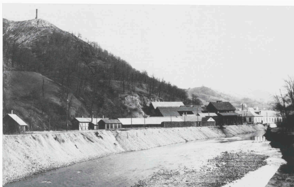
Fig. 5. Smelting plant (Idrija Mercury Mine Archive, 1960).

As already mentioned, ore contained on average 2% of mercury in the 1840s. In the years that followed, the mercury content of excavated ore decreased rapidly, amounting to a mere 0.66% at the end of the century. In this period, however, the quantity of extracted mercury increased gradually from approximately 160 to over