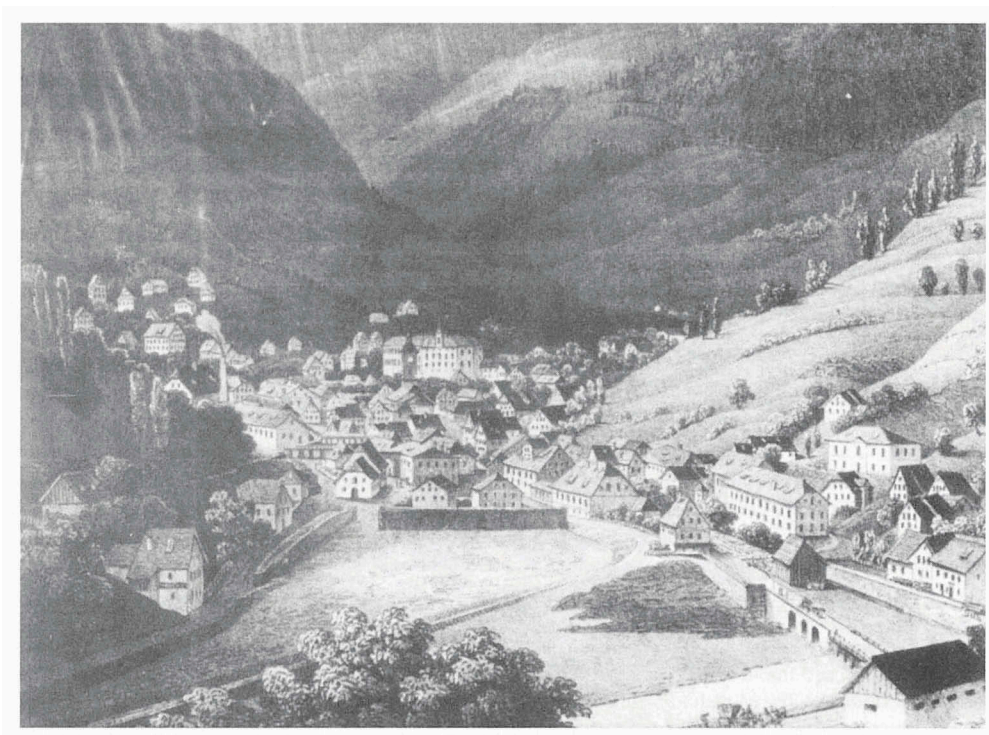
Fig. 1. Idrija, painted by Goldstein in 1840.

(anthropogenic) mercury compositions became closely interwoven, bringing enormous environmental consequences for the population and environment of Idrija. For this reason Idrija is rightfully called a “mercury laboratory” (Čar & Dizdarevič, 2003).