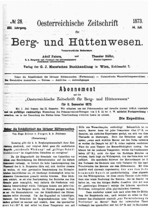
Fig. 4. Oesterreichische Zeitschrift für Berg- und Hüttenwesen (Perger, 1873).