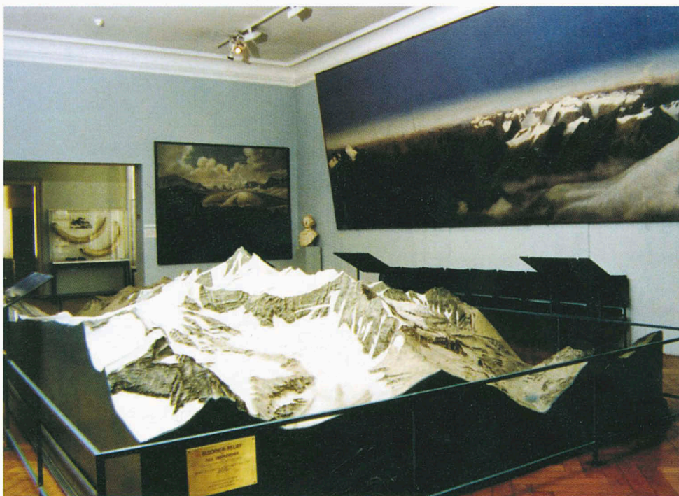
Fig. 3. Glocknerpanorama.