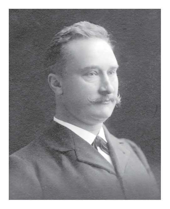
Fig. 1. Eugène Dubois was the first to describe the fossil locality of Tegelen.

annual report, "On route to Sint Pieter, with your permission, I made a visit to a recently discovered locality for fossil mammals from the end of the Tertiary or the beginning of the diluvial period at Tegelen near Venloo. I was granted the opportunity to collect some fossils with great scientific value, which now have been incorporated in the cabinet. As a result of the finds, you instructed me to inspect a larger collection that was previously gathered by Dr. Stijns in Venloo and, if possible, to obtain it at least as a loan for a comparative study."