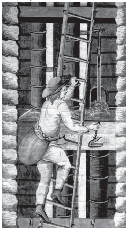
Fig. 2. Mining worker by the water column machine in the shaft. Detail from the mining map dating back to the 2nd half of the 18th century.

The mention of the model of a wind smelting furnace dates back to 1653. Daniel David Mossmann was paid 12 Reichstalers for it. Three models of Štiavnica's mines cost 1039 florins and