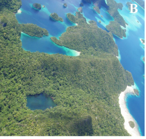
Figure 1. A Suberites diversicolor purple color morph. B Landlocked marine lakes in Raja Ampat Indonesia. doi:10.1371/journal.pone.0075996.g001

lake populations, suggesting little to no gene flow at small spatial scales ranging from 10 to 100 km (Table 1). Furthermore, molecular markers revealed the presence of highly divergent, but morphologically cryptic species in a number of taxa such as cnidarians, crustaceans, fish and mollusks [11,22,23, 28,29,30,31,32]. There are, however, exceptions to this general pattern, which have been interpreted as resulting from life history strategies involving greater dispersal capabilities [33] or too limited sampling [34].