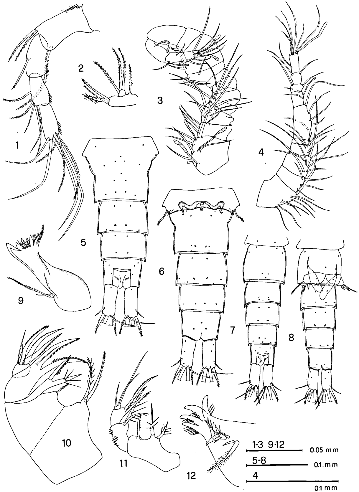
Figs. 1-12. Neocyclops (Neocyclops) petkovskii n.sp. (holotype: 2, 4-6, 10,12) (allotype: 3, 7, 8) (paratype: 1, 9, 11): 1, antenna; 2, maxillular palp; 3, antennula; 4, antennula; 5, abdomen and furcal rami (dorsal view); 6, abdomen and furcal rami (ventral view); 7, abdomen and furcal rami (dorsal view), 8, abdomen and furcal rami (ventral view); 9, mandible; 10, maxilla; 11, maxilliped; 12, maxillular praecoxa, inner.