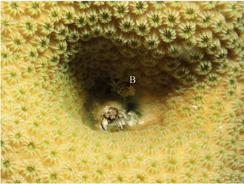
Figure 2. A female Troglodactylus corallicola (A) in her lodge inside a colony of the coral Orbicella annularis , with a free-living male (B) residing closely.

Kroppcarcinus siderastreicola is recorded here outside of Brazil for the first time, with Siderastrea siderea and Stephanocoenia intersepta as new hosts. Opecarcinus hypostegus , representing a new record for Curaçao, was found in association with five Agaricia species, of which Agaricia humilis is a new record. The agariciid Helioseris cucullata was encountered on a few reefs, but was not found inhabited by cryptochirids. Troglodactylus corallicola was associated with a wide range of hosts, but did not occur in association with Agariciidae (Table 1).