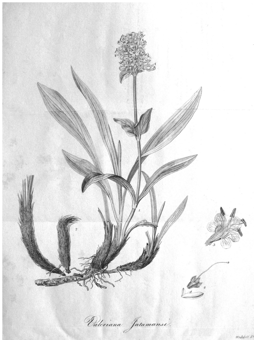
Fig. 1 Lectotype of Patrinia jatamansi D.Don (the basionym of Nardostachys jatamansi (D.Don) DC.). Engraving from Lambert (1821) (Royal Botanic Garden Edinburgh).

synonymy 'V. spica Vahl, Enum. 1 [i.e. 2 (1805)]. p. 13' (a superfluous name for Jones's V. jatamansi , and therefore also not applicable to what is now the Nardostachys ). In other words, Patrinia jatamansi D.Don was in effect a new species for what is now the Nardostachys , its type being the Wallich material from Bhutan cited by Don.