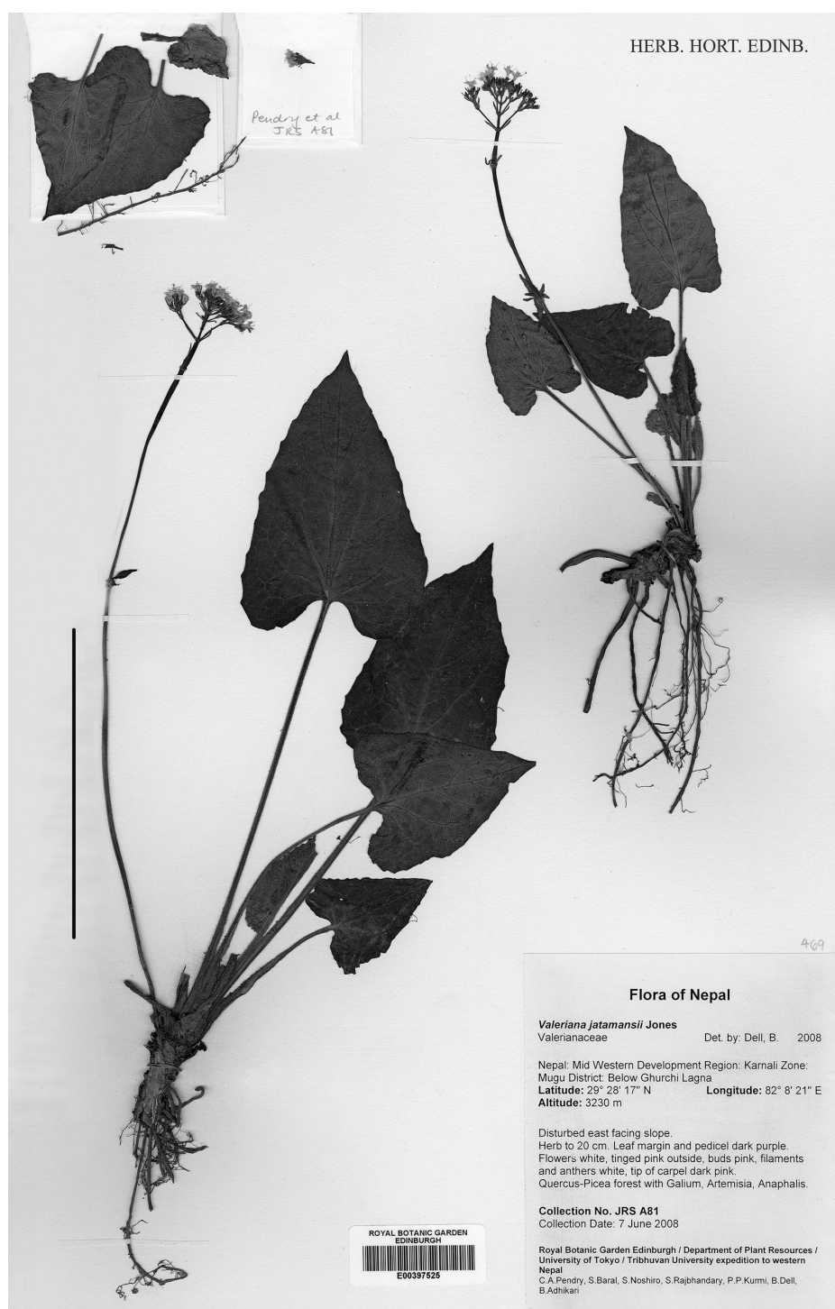
Fig. 3 Epitype of Valeriana jatamansi Jones – a recent specimen from western Nepal (E). — Scale bar = 10 cm.

[ Valeriana jatamansi sensu D. Don, in Lamb. (1821) 180, t., non Jones (1790)].