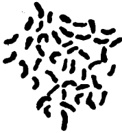
Strychnos aculeata Solered. 2n = 44