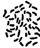
Strychnos spinosa Lam. 2n = 44