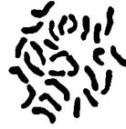
Spigelia splendens hort. Wendl. ex W.J.Hook. 2n = 26