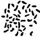
Strychnos congolana Gilg. 2n = 44