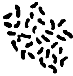
Spigelia anthelmia L. 2n = 32