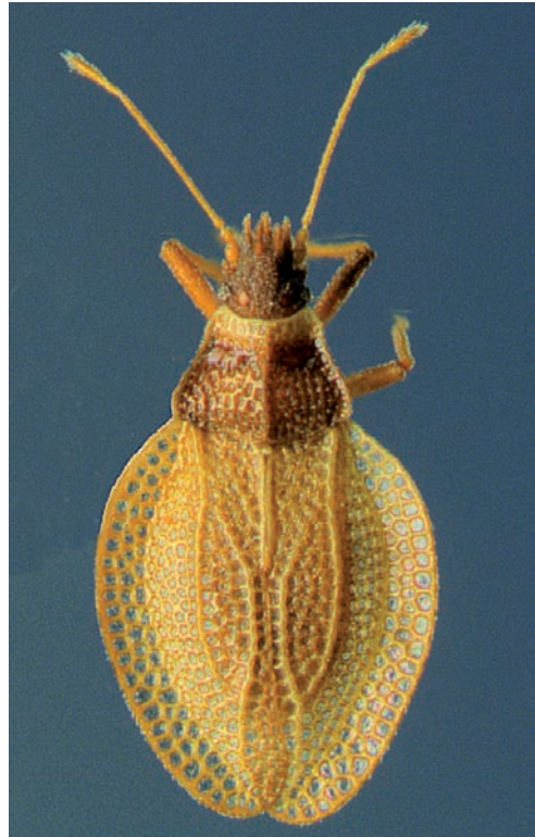
Fig. 5, Zetekella caroli spec. nov., female allotype, dorsal aspect; the left interocular plaque is well visible. Length: 2 mm.

Thorax.— pronotum trapezoid, wider than long, moderately convex, finely areolate; paranota narrowly elevated, 1-seriate; lateral margins in middle slightly concave; posterior angles rounded; posterior margin slightly convex, ante-