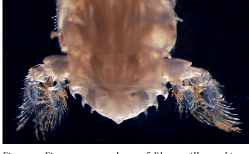
Figure 3. First two appendages of Platysquilla eusebia including the raptorial claw (below) covered with spines with which it 'spears' its prey. Figure 3. Voorste twee klauwen van Platysquilla eusebia . De dieren gebruiken de vangklauw (onderste) met vele lange stekels om prooien te doorboren.

prey that happen to wander along its burrow. The present record in 2005 is the first record of a settled specimen in the North Sea and thereby the northernmost record in Europe. As no other specimens have been recorded during the surveys in the North Sea since 2005, it remains unclear whether a population of the species has established itself. At present many changes occur in marine benthic communities because of climate change and human activies like ballast water discharge. Recently new tools like DNA profiling contribute to the discovery of new species in the North Sea.