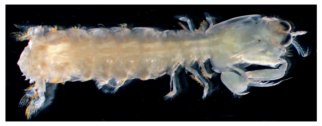
Figure 1. The stomatopod Platysquilla eusebia .

42 meter. On board each sample was washed on a I mm mesh sieve and stored in a container in a 4% formaline/seawater solution. In the laboratory, the samples were washed again on a 0.5 mm mesh sieve, sorted, analysed and stored in 70% ethanol. During the analysis of a sample taken on the Dutch Dogger Bank (lat. 55.402943, long. 3.811921) (fig. 2), a stomatopod was found (fig. 1). It had not been encountered during any prior Imares surveys and could not be identified with standard taxonomical literature for species that occur in The Netherlands. Therefore the help of stomatopod specialist Jessica Taylor of Unicomarine and Shane Ahyong, the taxonomic editor of Stomatopods for WORMS (World Register of Marine Species: www.marinespecies.org), was